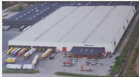
Skånlog warehouse building in Eskilstuna