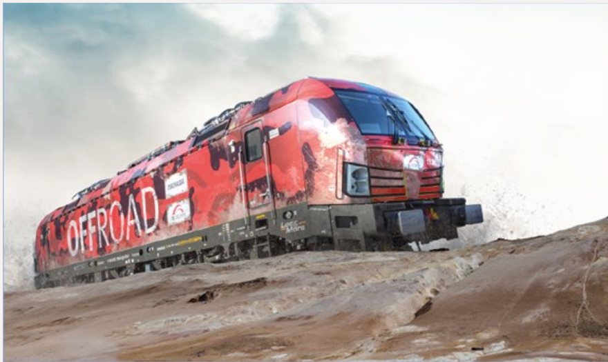
TX Logistik is going off-road. They are moving traffic from the roads to the rail network.

The rail operator TX Logistik has now begun its seven weekly round trips from Trelleborg to Eskilstuna. This means there are 500 fewer trucks on the roads per week.