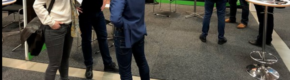
Eskilstuna Logistics at EasyFairs, Malmö, 6-7 februari 2019