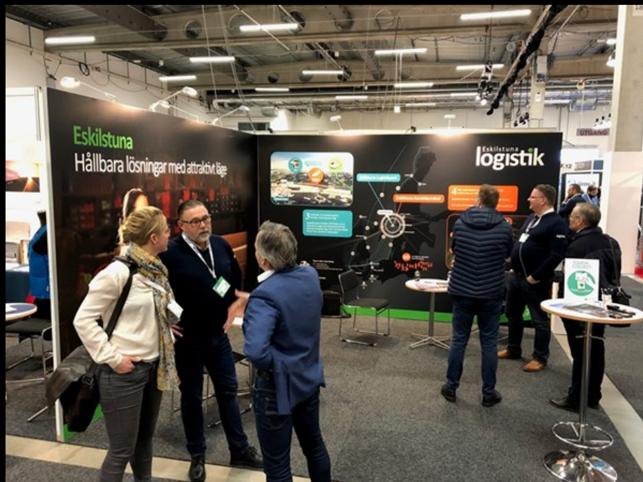
Eskilstuna Logisticsmonter at EasyFairs, Malmö, 6-7 Februari 2019